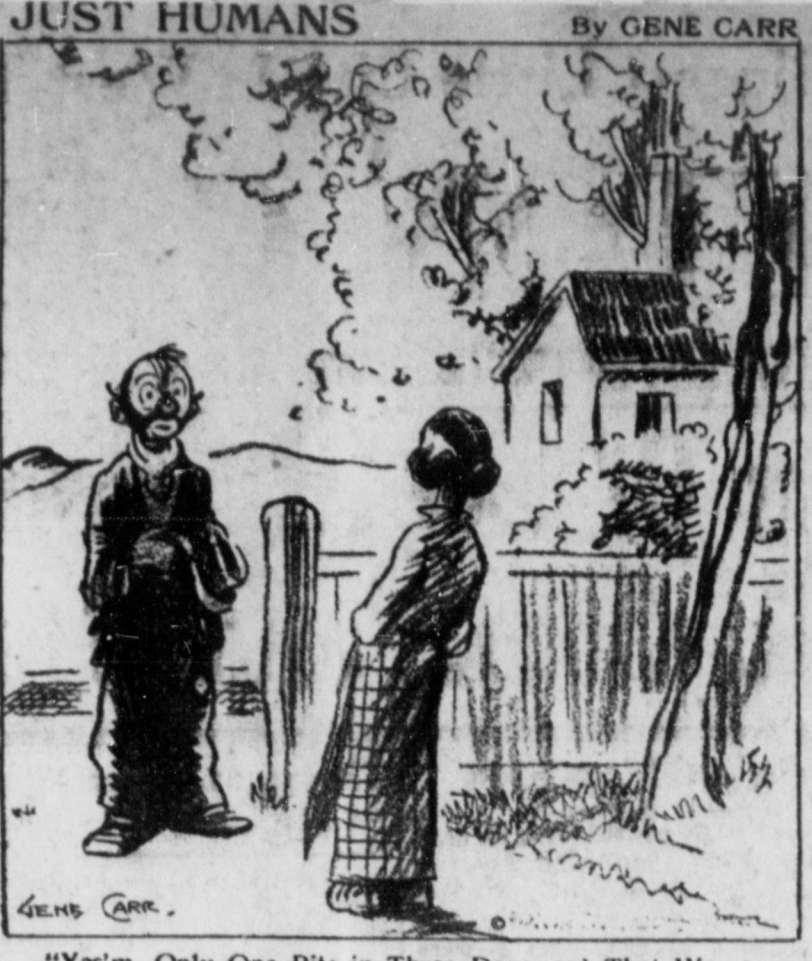
"Yes'm, Only One Bite in Three Days, an' That Was a Mosquito Bite!"