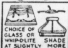
CHOICE OF GLASS OR WHIPO-LITE SHADE AT SLIGHTLY MORE

All you need to do to take advantage of this generous offer, is to come in and get acquainted with the quality and service of this store, and when your purchases here amount to $10.00 this beautiful new Aladdin table lamp is yours upon payment of only $3.25. You are assured of full value for every penny you spend, and in addition you save the substantial sum of $1.70. We are making this special limited time offer to acquaint more people with the fact that it pays to trade with us, for we believe that once you are a customer —you will always be a customer.