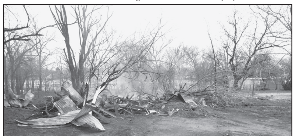
HOUSE DESTROYED-A vacant house in the 900 block of South First in Haskell was totally destroyed by fire late Tuesday night, Feb. 19. The fire caught in the trees and grass on the south side of the creek. Haskell fire department members contained the fire and city employees helped with the debris.