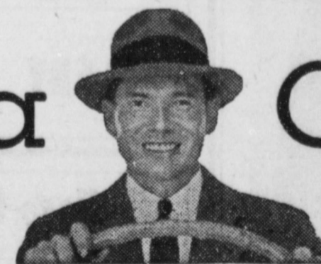
America's First Family of Fine Cars At your Chrysler-Plymouth dealer's

"The Power of Leadership is yours in a Chrysler"