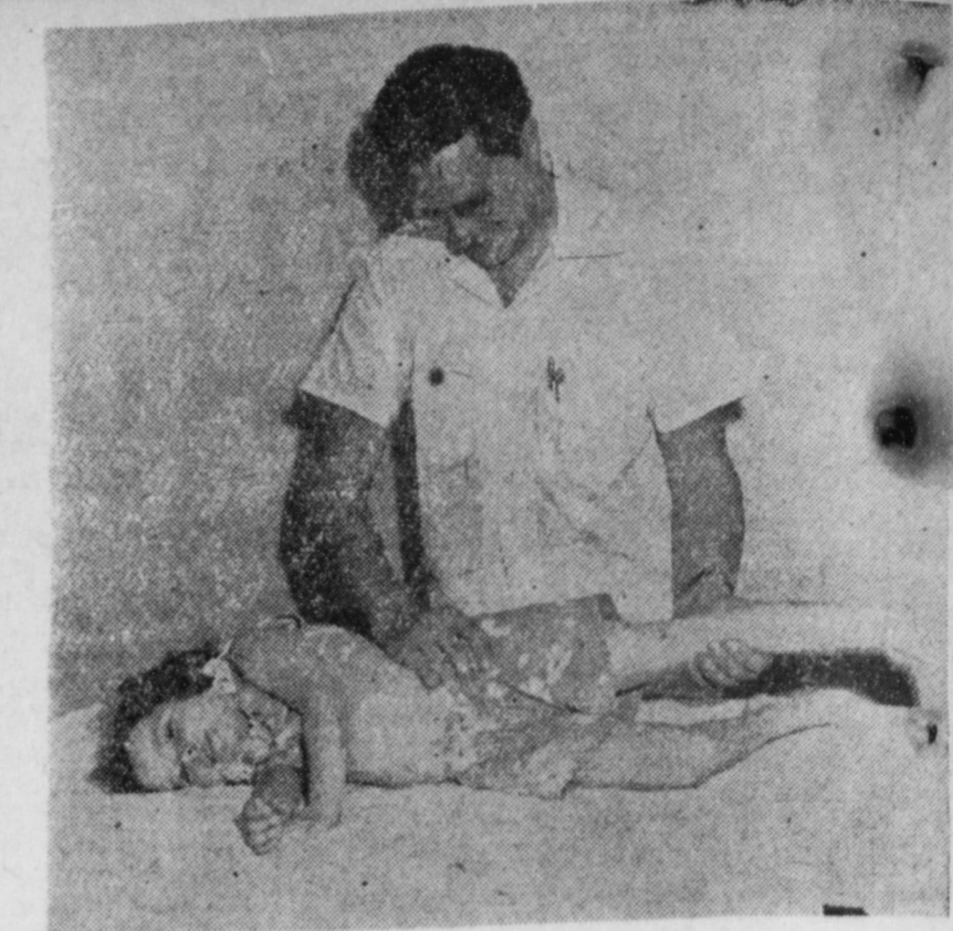
FAITH AND HOPE are reflected in the face of this tiny youngster as she receives prescribed physical rehabilitation treatments from the hands of her physical therapist at Gonzales Warm Springs Foundation for Crippled Children. She is but one of many such youngsters at the Foundation, who face the long hours of concentrated effort in their personal fight for freedom with courage and determination.