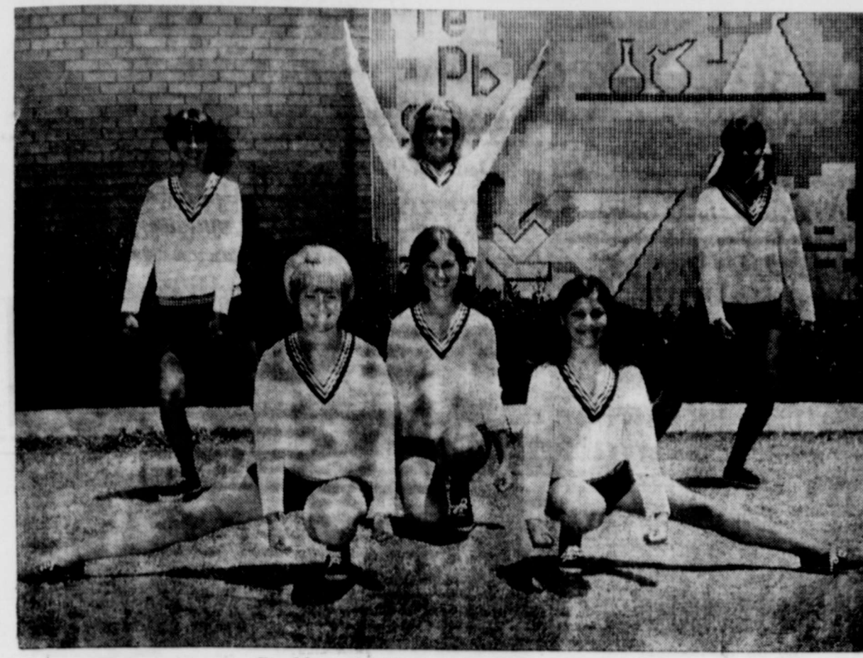
Burkburnett High School Cheerleaders