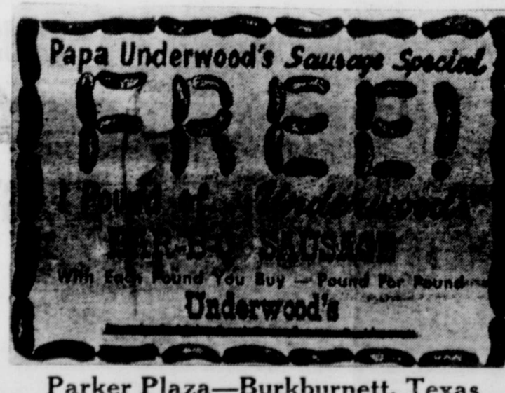
Parker Plaza-Burkburnett, Texas