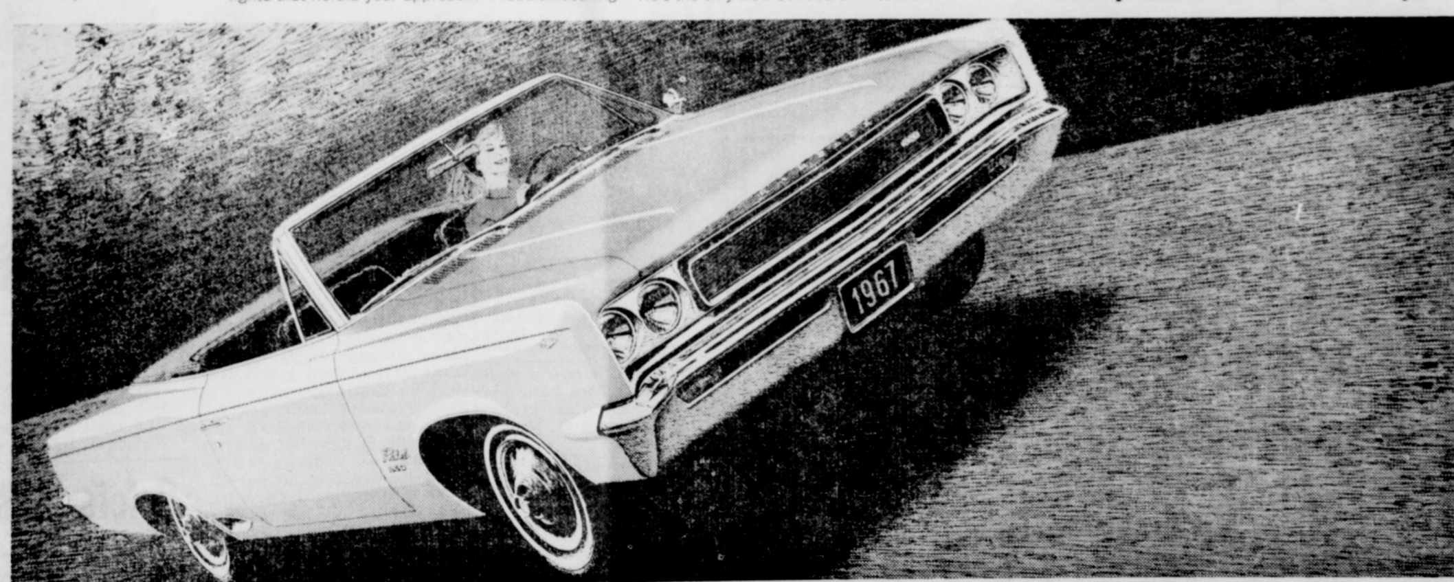
first Excitement Machines in the intermediate class! A choice of five engines, topped by a 343 cu. in. Typhoon V-8. A wide road An SST convertible (above) that seats 3 in back comfortably. Rebel: SST elbase. Excitement that's 197" long, 78" wide, 54" high. stance and 4-link rear suspension to glue down corners, untwist curves.