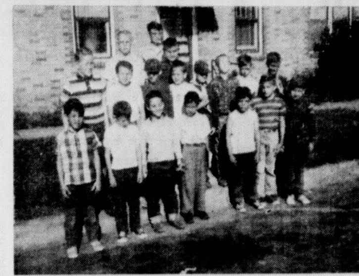
Burk Star visitors Tuesday were Cub Scout Dens One, Three and Seven, Pack 155.