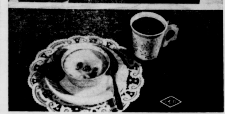
DESSERTS and other foods that once required hard-to-clean baking dishes can now be baked and served in disposable Mira-Glaze dishes, ideal for picnicking. Plastic-lined cups and dishes can take heats up to 350 degrees.

Reserve power . are nothing more than a rever- enough to handle heavy bat- Beaters and bowls . . . that have filaments that do not get The motor should have a sealed-