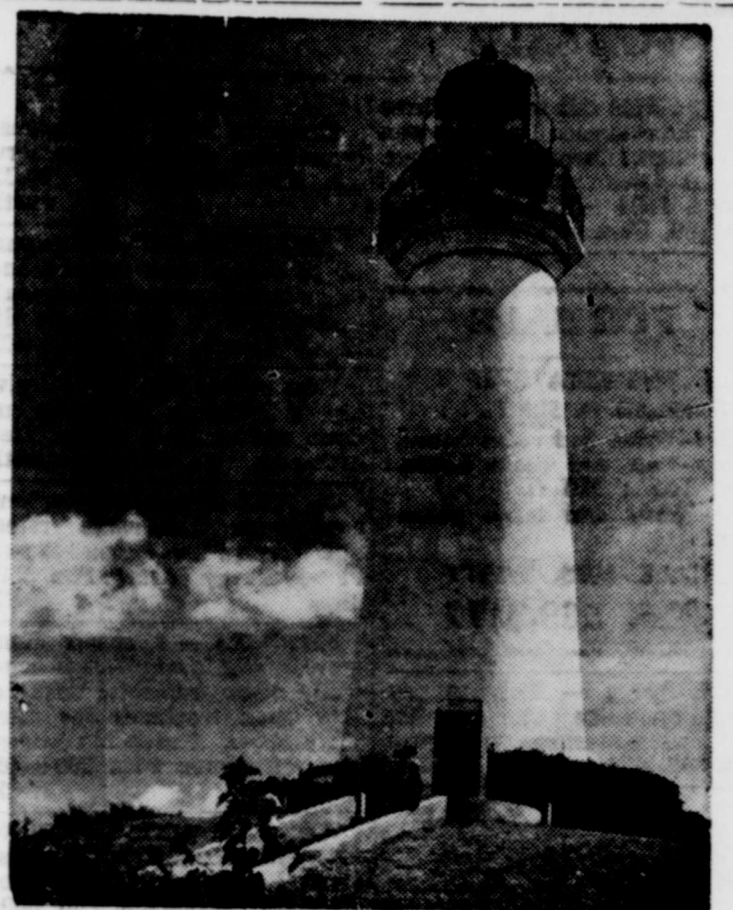
PORT ISABEL LIGHTHOUSE — A sentinel over beaches that once sheltered Spanish explorers, Indians, and pirate treasure, this structure marks historic Port Isabel State Park on the to

OUR AMERICAN HERITAGE AND THE CRISIS IT FACES