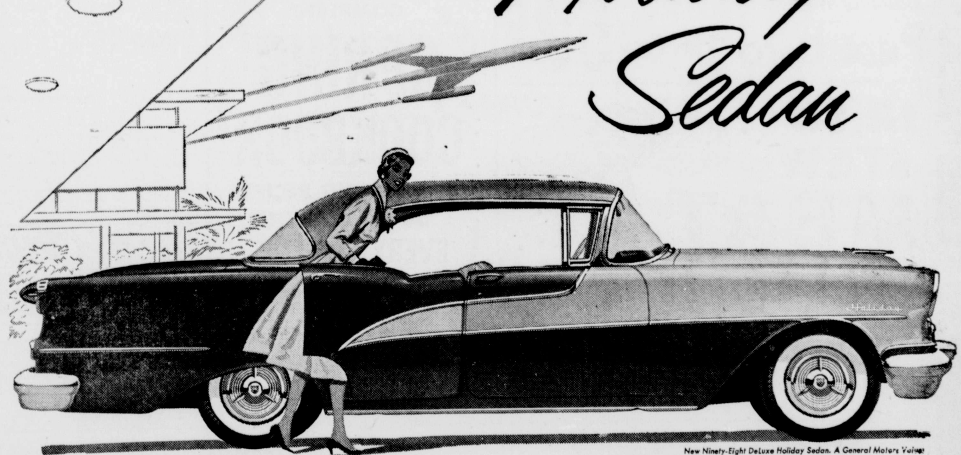
New Ninety-Eight Deluxe Holiday Sedan. A General Motors Vehicle

IT'S A HARDTOP WITH 4 DOORS! It's the new Holiday Sedan by Oldsmobile—the first completely new body type since the introduction of the Holiday Coupé. Here you find all the long, smooth-flowing beauty and charm of a hardtop : : plus the easy-in-easy-out spaciousness of a four-door. Yes, here's four-door sedan space with hardtop grace! And, best of all, only Oldsmobile brings you this thrilling new model in all three series—"88", Super "88" and Ninety-Eight! See them at your Oldsmobile dealer's.