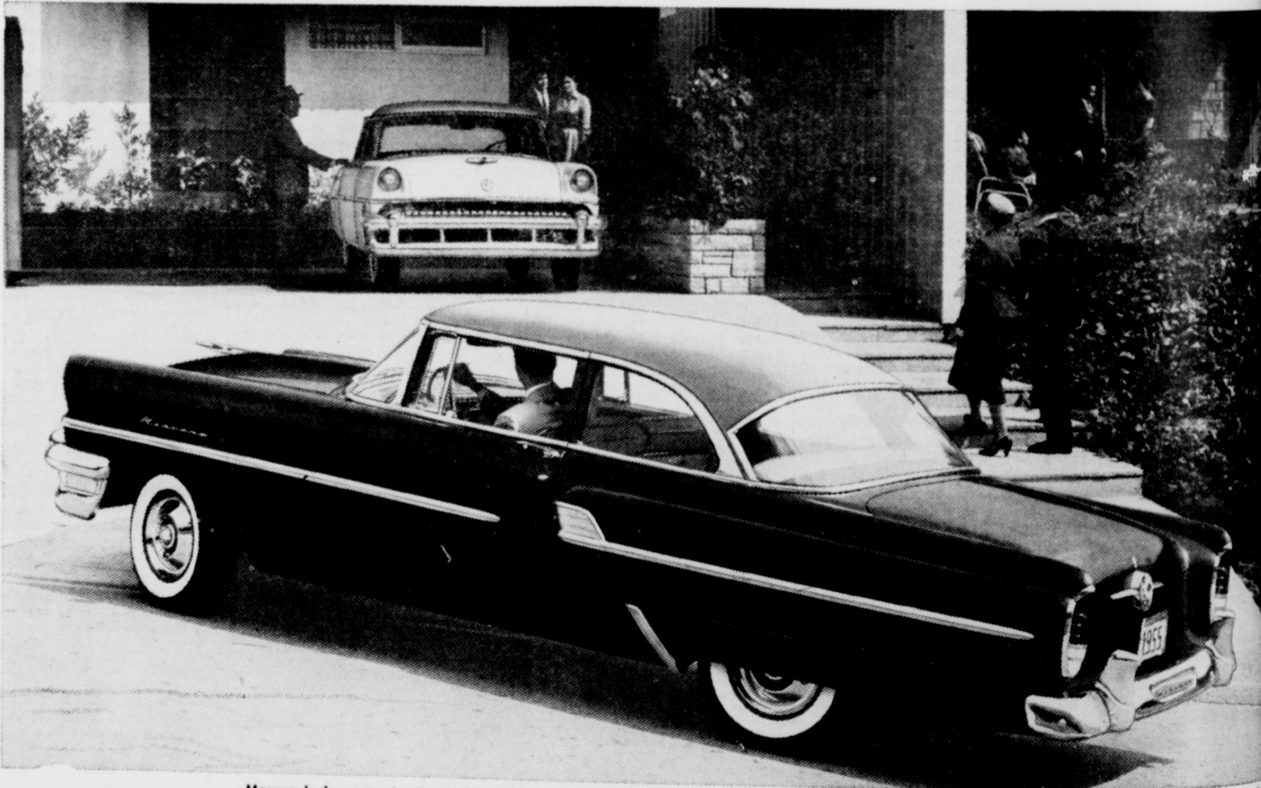
Mercury's lowest-priced car—the 188-hp Custom 2-door 6-passenger Sedan—is shown above. Other models in the Custom series are: a 4-door Sedan, a hardtop Coupe, and a new 4-door all-metal 8-passenger Station Wagon.

Mercury's prices start below 13 models in the low-price field*