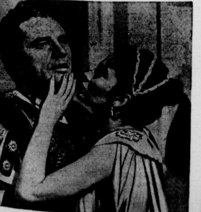
moment of great decision in "The Robe," initial CinemaScope production from Twentieth Century-Fox, in color by Technicolor. The film stars Richard Burton and Jean Simmons. Showing at The PALACE THEATRE March 20-22