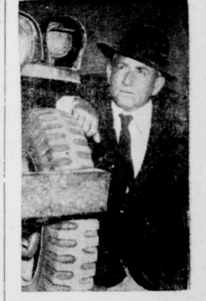
Honorable R. B. Anderson Deputy Secretary of Defense

Today we are only fairly into an era quite different from any other in our national life, one which will test to the utmost the capacity of our democracy to cope with the gravest problems of modern times, and on a scale never before seen in human history.