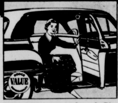
STEP OUT—not crawl out! Big Dodge doors swing open wide—are held open by "safety checks."

See this year's BIGGER VALUE Dodge at your dealer's now. Drive the new car that gives most for your money today—in comfort, ruggedness, dependability. Stop in today!