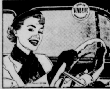
DRIVE WITHOUT SHIFTING! Dodge Coronet models give you Gyro-Matic to free you from shifting.