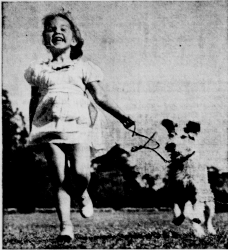
Children at play are among the choicest subjects. When you see an opportunity for a shot like this, don't take chances; make sure you'll have a good one by taking several.