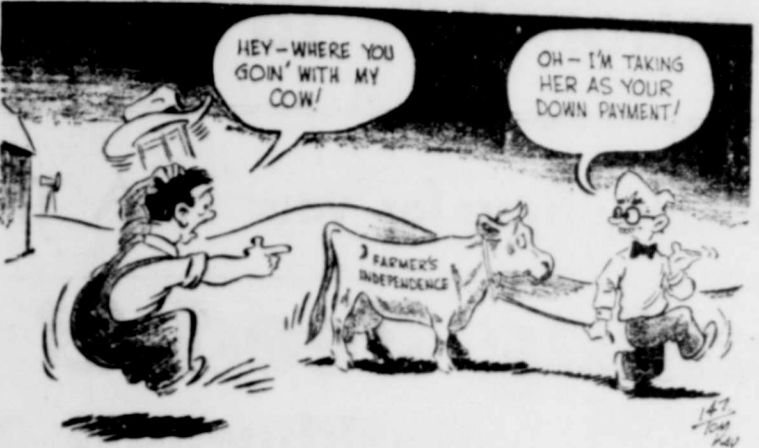
Milking the Farmer