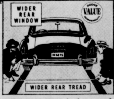
WIDER REAR TREAD for better road stability. A huge new rear "picture window" for safer driving vision.