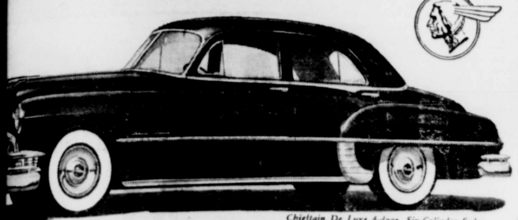
Chieftain De Luxe 4-door, Six-Cylinder Sedan (including white sidewall tires and bumper wing guards)

America's Lowest-Priced Straight Eight Lowest-Priced Car with GM Hydra-Matic Drive Optional on all models at extra cost. Power-Packed Silver Streak Engines—Choice of Six or Eight World Renowned Road Record for Economy and Long Life The Most Beautiful Thing on Wheels