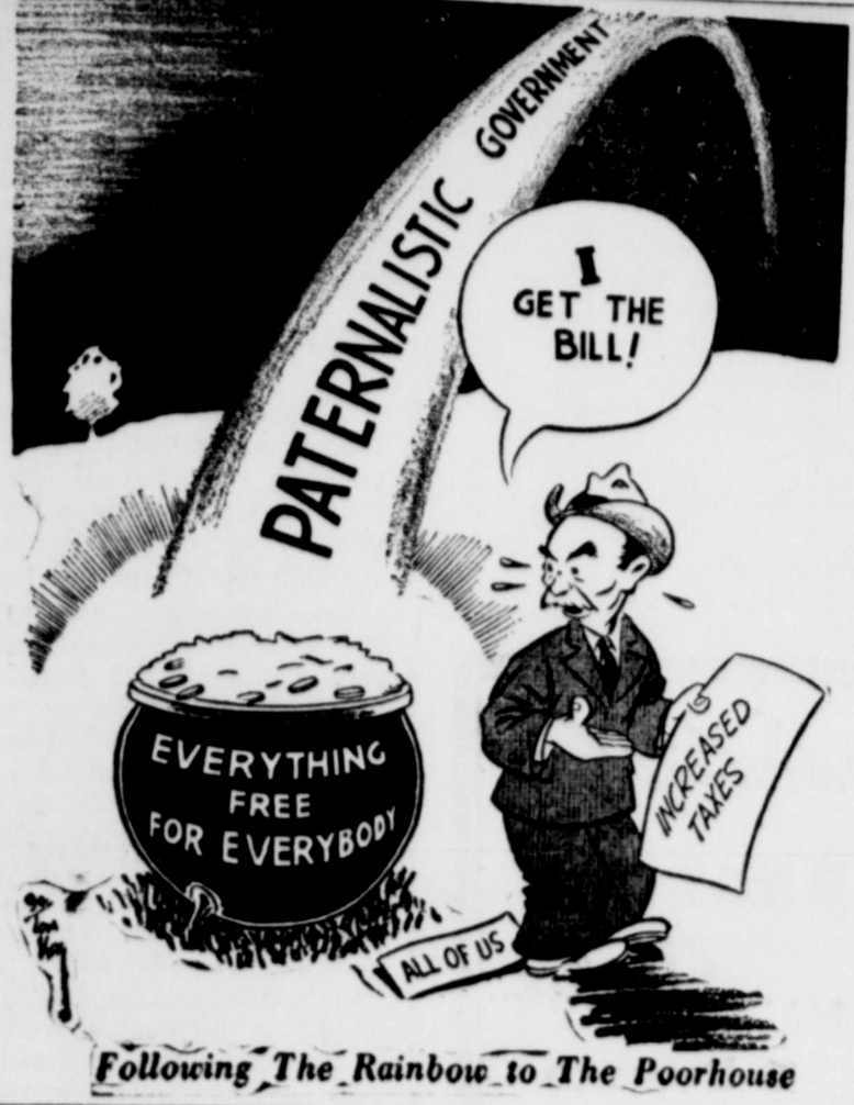
Following The Rainbow to The Poorhouse