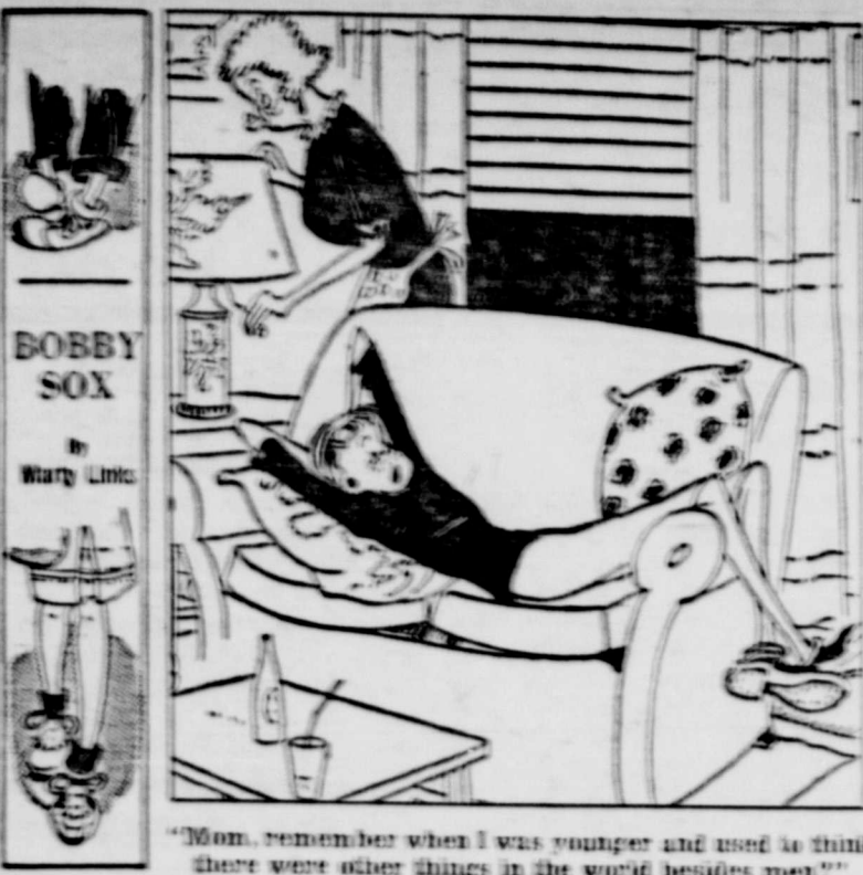
"Mom, remember when I was younger and used to think there were other things in the world besides men?"