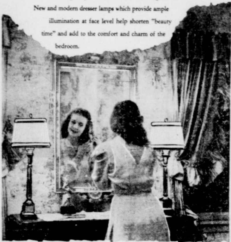
Appliance, Department and Furniture Stores Have New and Modern Lamps Available Now!

Proper lighting is a valuable aid to beauty and the very best in lighting is essential for the dressing table. New and modern dresser lamps which provide ample illumination at face level help shorten "beauty time" and add to the comfort and charm of the bedroom.