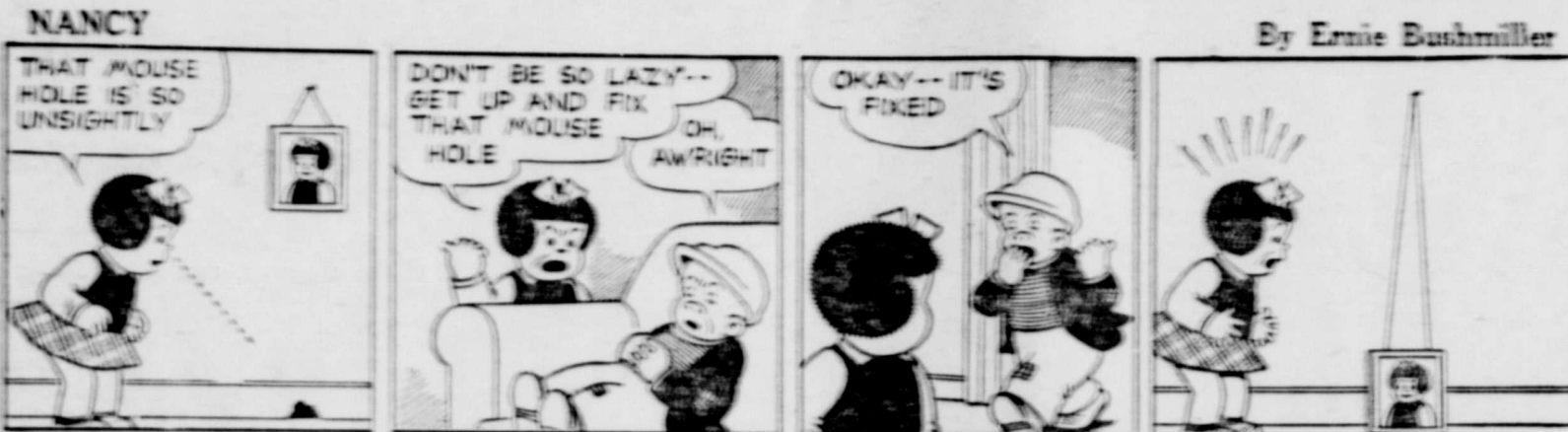
NANCY By Ernie Bushmiller