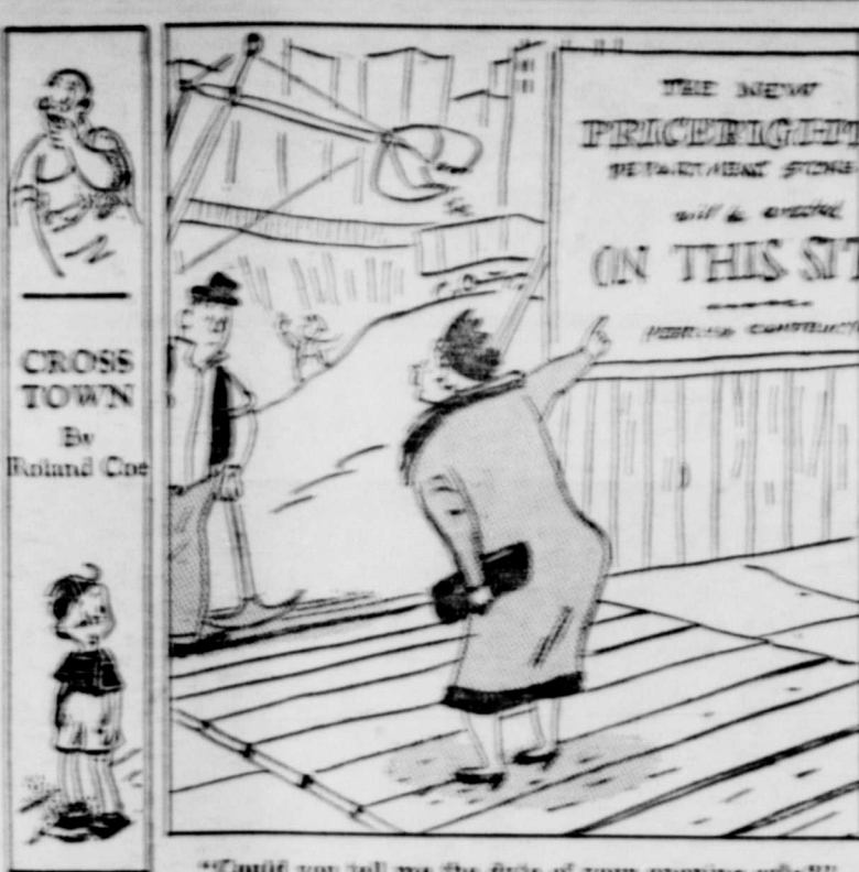
"Could you tell me the date of your opening sale?"