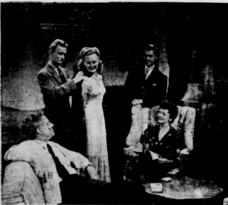
Coming to PALACE THEATRE Soon

LIFE HANDLE WITH CARE! When you're in the driver's seat human