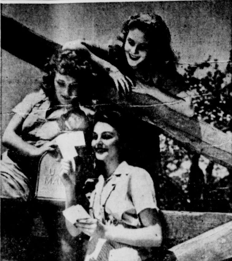
Good grouping makes a charming and lifelike shot that tells a story of the morning's mail with news and snapshots from home.