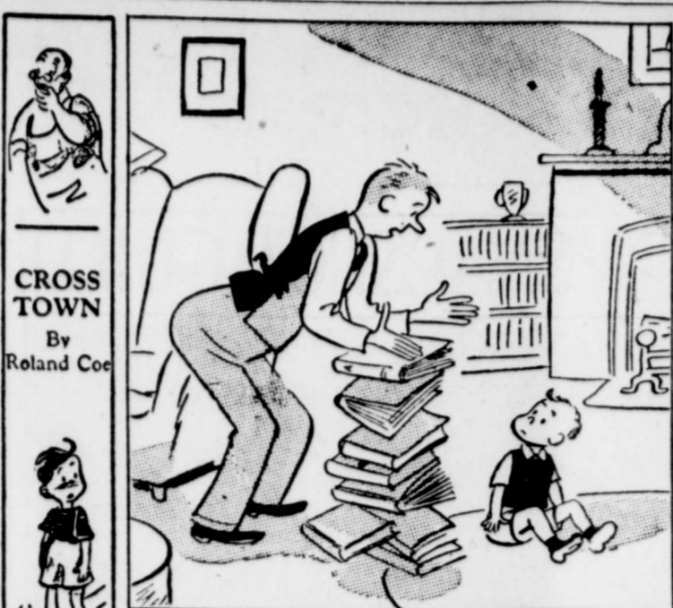
"The man who sold me this set of children's encyclopaedias said you could answer all your own questions. Here—go ahead and DO it."