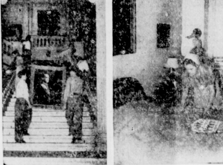
As country seethes with civil strife, servants prepare palace for return of King George II. At left, workmen carry portrait of monarch up staircase to reception room. At right, chambermaid tidies coverlet embroidered with crown on King's bed.

EDITOR'S NOTE: When opinions are expressed in these columns, they are those of Western Newspaper Union's news analysis and not necessarily of this newspaper.