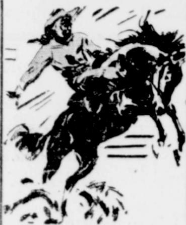
BOOM TOWN Celebration and RODEO JUNE 20-21-22