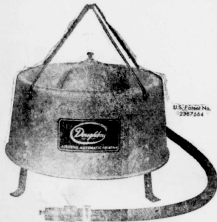
U.S. Patent No. 2387664