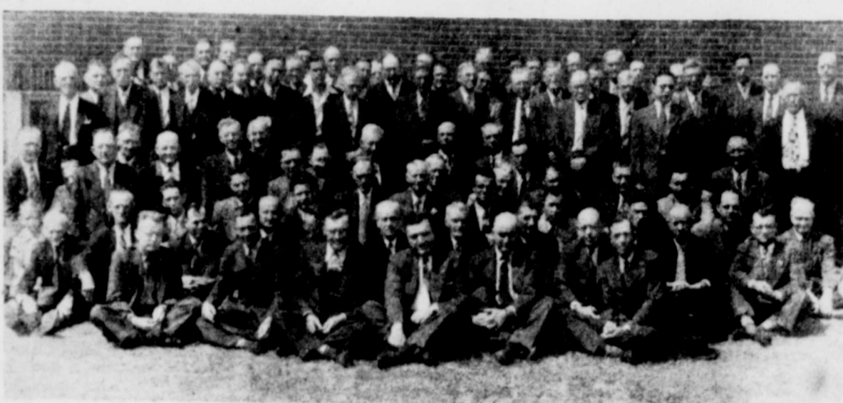
The Men's Bible Class of the Methodist Church realized a long cherished dream on Easter Sunday when it had one hundred in attendance.