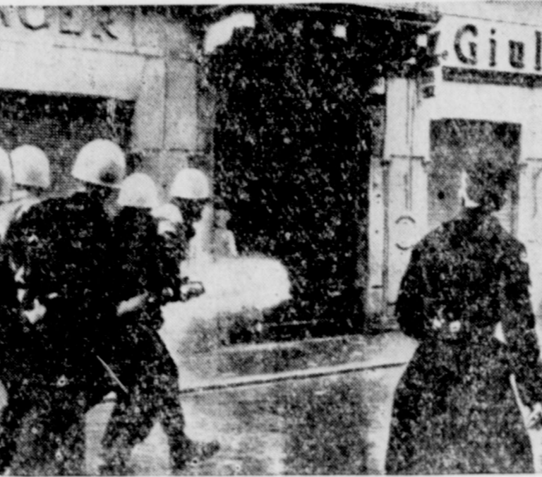
Presently held by Italy but sought by Yugoslavia, strategic Adriatic port of Trieste has been troublesome bone of contention in the peace-making. During visit of United Nations commission to area, Yugoslavs staged rally demanding port and civil guards are shown dispersing straggling demonstrators with fire hose.

Released by Western Newspaper Union. (EDITOR'S NOTE: When opinions are expressed in these columns, they are those of Western Newspaper Union's news analysis and not necessarily of this newspaper.)