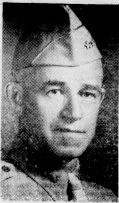
GEN. OMAR N. BRADLEY Administrator of Veteran Affairs

DALLAS, Tex., April 23.—Encouraging progress in processing Texas, Louisiana and Mississippi veterans' disability claims and providing adequate hospitalization was reported Tuesday by General Omar N. Bradley, Administrator of Veterans Affairs, who came here on a trip of inspection.