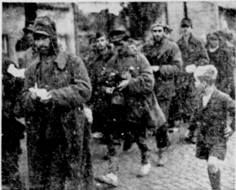
No longer capable of doing heavy labor, and sick, diseased and dispirited, German prisoners of war released by Russians trek through Berlin on their return to homes in the west.

Released by Western Newspaper Union. (EDITOR'S NOTE: When opinions are expressed in these columns, they are those of Western Newspaper Union's news analysis and not necessarily of this newspaper.)