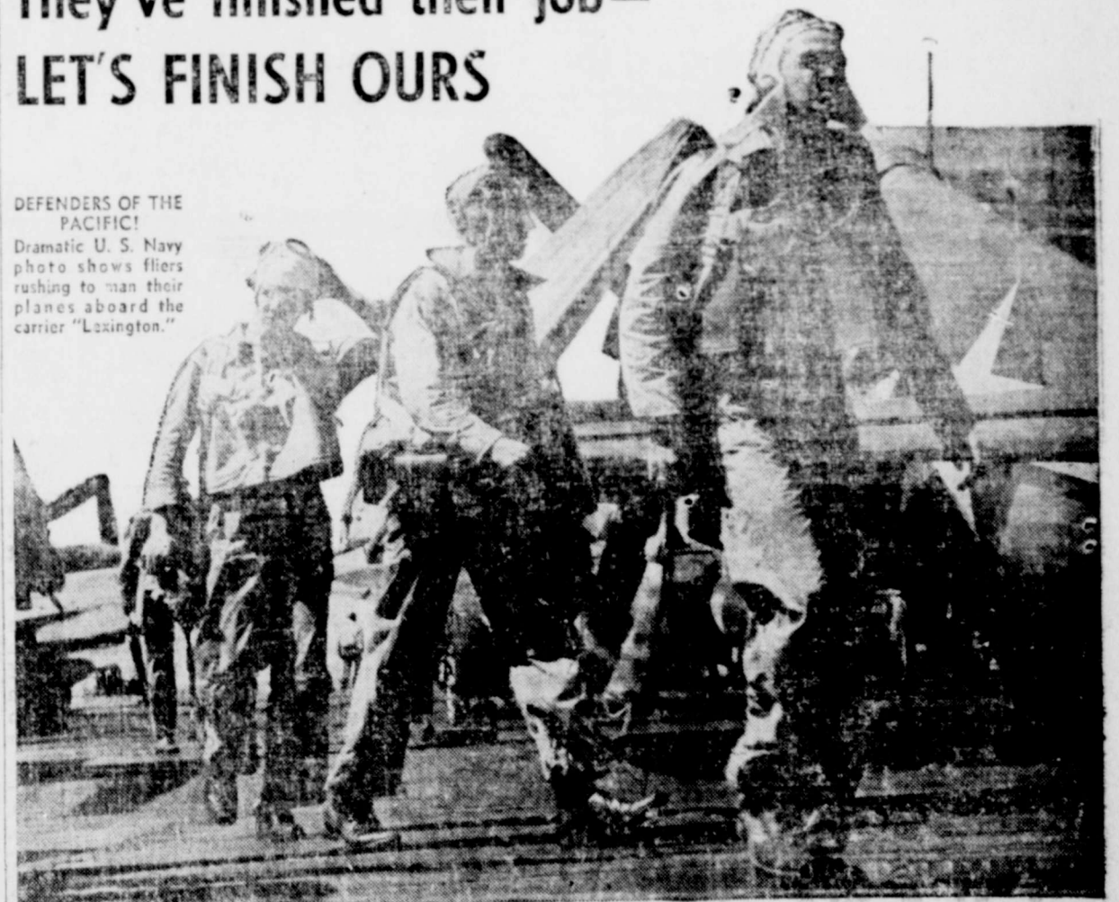
DEFENDERS OF THE PACIFIC! Dramatic U. S. Navy photo shows fliers rushing to man their planes aboard the carrier "Lexington."