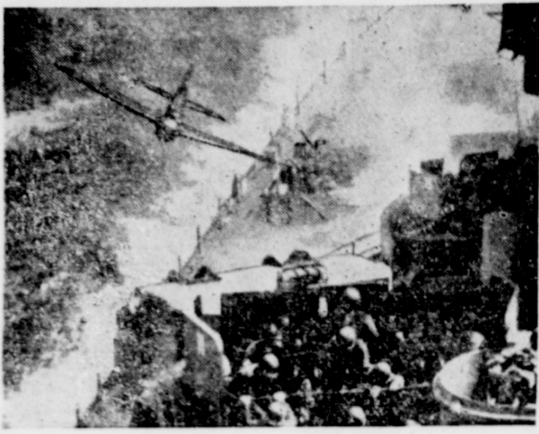
Spectacular photo shows Jap pilot trying to maneuver plane for suicidal crash-dive on American warship off Okinawa.

Released by Western Newspaper Union. EDITOR'S NOTE: When opinions are expressed in these columns they are those of Western Newspaper Union's news analysis and not necessarily of this newspaper.