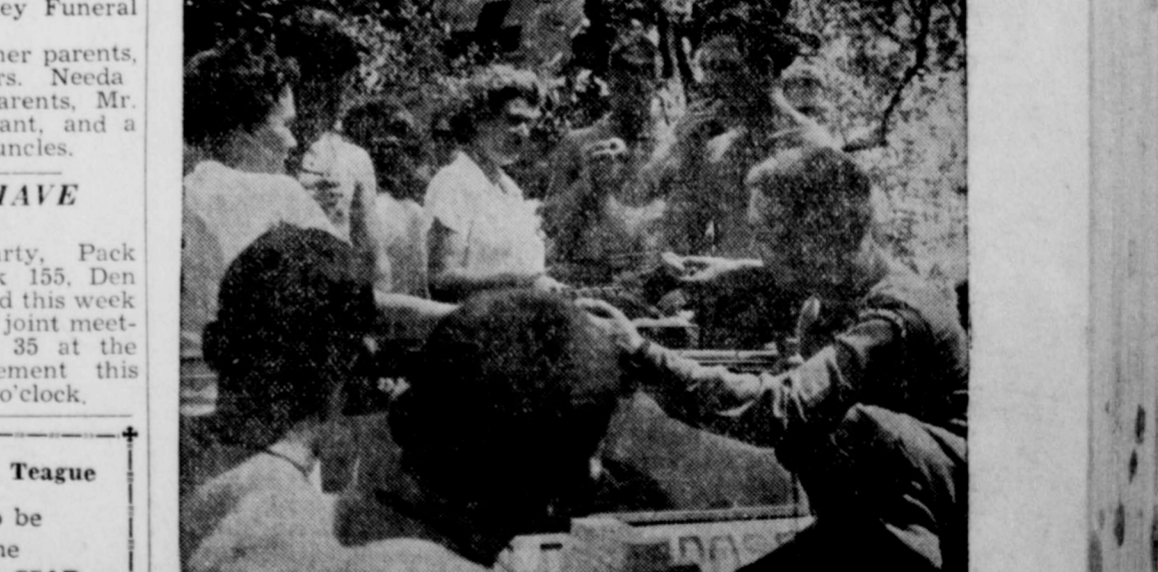
DOUGHNUTS MEAN HOME—Here Red Cross clubmobile girls pass out doughnuts to an American Ranger unit not far from a European battle front. An American girl and sinkers like his mother makes boosts a soldier's morale.

This Advertisement in the Interest of the RED CROSS WAR LOAN DRIVE Made Possible by the LaSALLE PETROLEUM CORP.