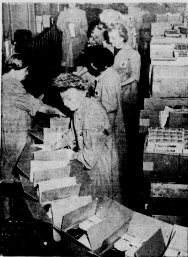
FOR WAR PRISONERS—Corner of the Prisoner-of-War food packaging center in Chicago. Here on a conveyor system, by mass production methods, thousands of parcels are packed each week for war prisoners. Three other centers also are operated by the Red Cross. This Advertisement in the Interest of the