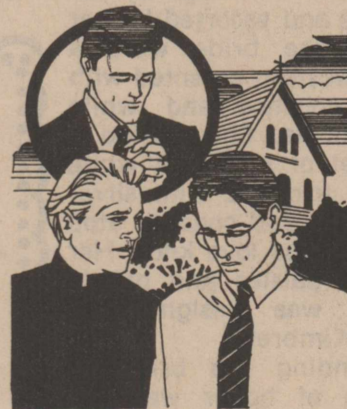
Dear Lord and Father of mankind, Forgive our foolish ways! —John Greenleaf Whittier

You have just had a terrible week. First, you received bad news about something. Then, as if that weren't enough, you acted on impulse and made some foolish statements that let certain people down and almost cost you a friendship of long standing. Altogether, you couldn't feel more depressed and your self-esteem has never been lower. Of course, you try to make amends with those people whom you inadvertently injured by your unwise remarks. Actually, none of this may describe your problems; but whatever they are, go to your House of Worship and talk to your clergyman. He will give you his best advice, for he is there to help people like you who are in some kind of trouble. And remember to thank God for this guidance He has provided for you, just when you needed it most.