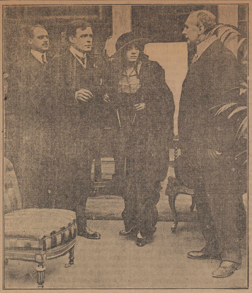
The Master Villain and His Adviser.

mates, and he ate heartily as usual. his time. It would have taken something more