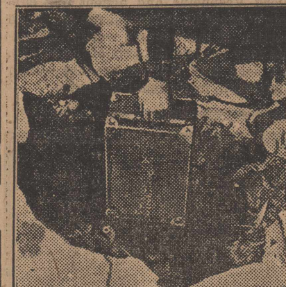
And That Is Why Jones Was Able, More the Original Box.

"Six hundred feet of water, if I've got my reckoning right. The anchor lies in 60 feet, but the starboard side drops sheer 600. You swab! Why yarn." didn't you bring the box to me? A man has a right to what he finds. I'd have taken care of it for you till we got back to port. I know; you were greedy; you thought I might want to stick my fist into your treasure. And you'll never find it in 600 feet of water and tangled, porous coral. That's what you get for being a blamed hog. As for you," and the captain turned to Dunkers, "get your dunnage and your pay and hunt for another boat back. I won't have no murder on board 'Cap-