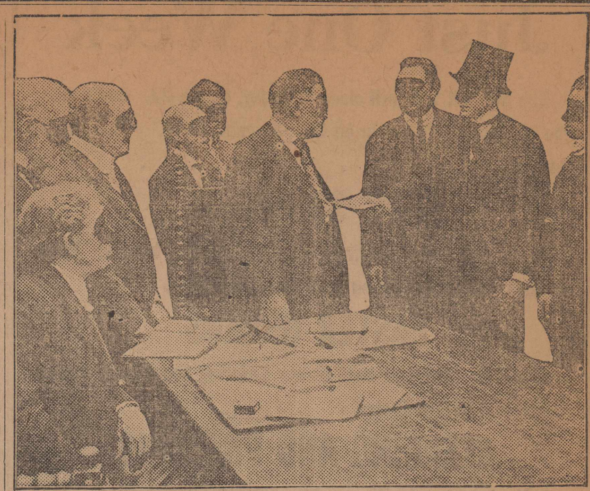
Count Paroff Presents His Credentials.

that there was no such word as arbi- Blossom had not thought to. The name tration in a sailor's vocabulary; his Hargreave had instantly brought back was overturned. isputes could be settled only in one to Dunkers' mind the newspaper anner, by his calloused fists. stories he had recently read. There Braine, furfous. When the old mudhook (and some was no doubt in the world that this break this renegade Hargreave." day Steve was going to buy it and box belonged to the missing million- left his lips. And as suddenly as they son house) slithered down into the smiling waters of the bay, Steve conover, there was no doubt in Dunkers' dently traitors among the black thuntact that all your plans and schemes cluded that discretion was the better | mind that this million lay in the Badred. part of valor. He would steal ashore haman waters. It had been drawn up on the quarantine tug which lay alongside. He was willing to fight under the path of the balloon. He proceeded, ordinary circumstances, but he must then, to take a most minute range. get his treasure in safety first. They It would require money and partners; he pried back the boards of his bunk mined to return to New York to find wall, took out the box, eyed it fondly, backing. Finding is keeping, on land backing. Finding is keeping, on land