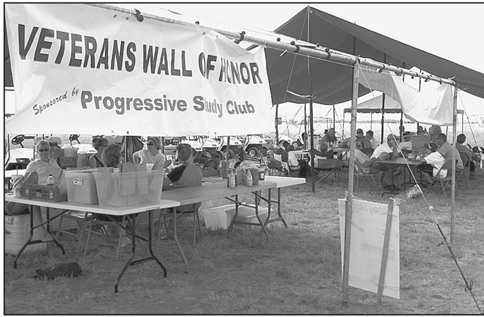
CONCESSION STAND —The Progressive Study Club sponsored a concession stand with the proceeds benefiting the Veterans Wall of Honor during the Clay Shoot held Sept. 3-4 in Haskell. The Clay Shoot benefited the Clear Fork Crime Stoppers.