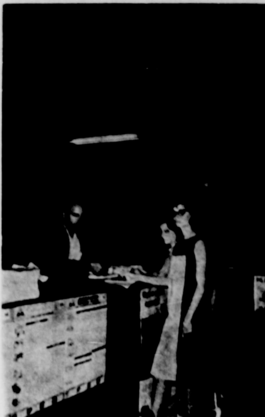
VISIT BUSINESSES — Two Graham 4-H girls are shown above as they visited two Olney businesses as part of a 4-H Club project. At left they are shown with Mrs. J. A.

4) Conservation of Soil and Water Resources — We must see that these vital resources are preserved, not only for our-