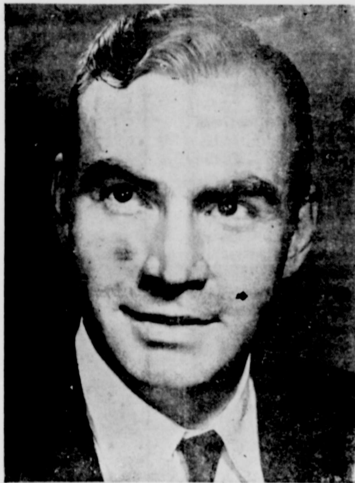
Cong. Jim Wright of Fort Worth

Young County Democrats will hold a gigantic rally at Graham Saturday, October 21st at noon, on the courthouse square.