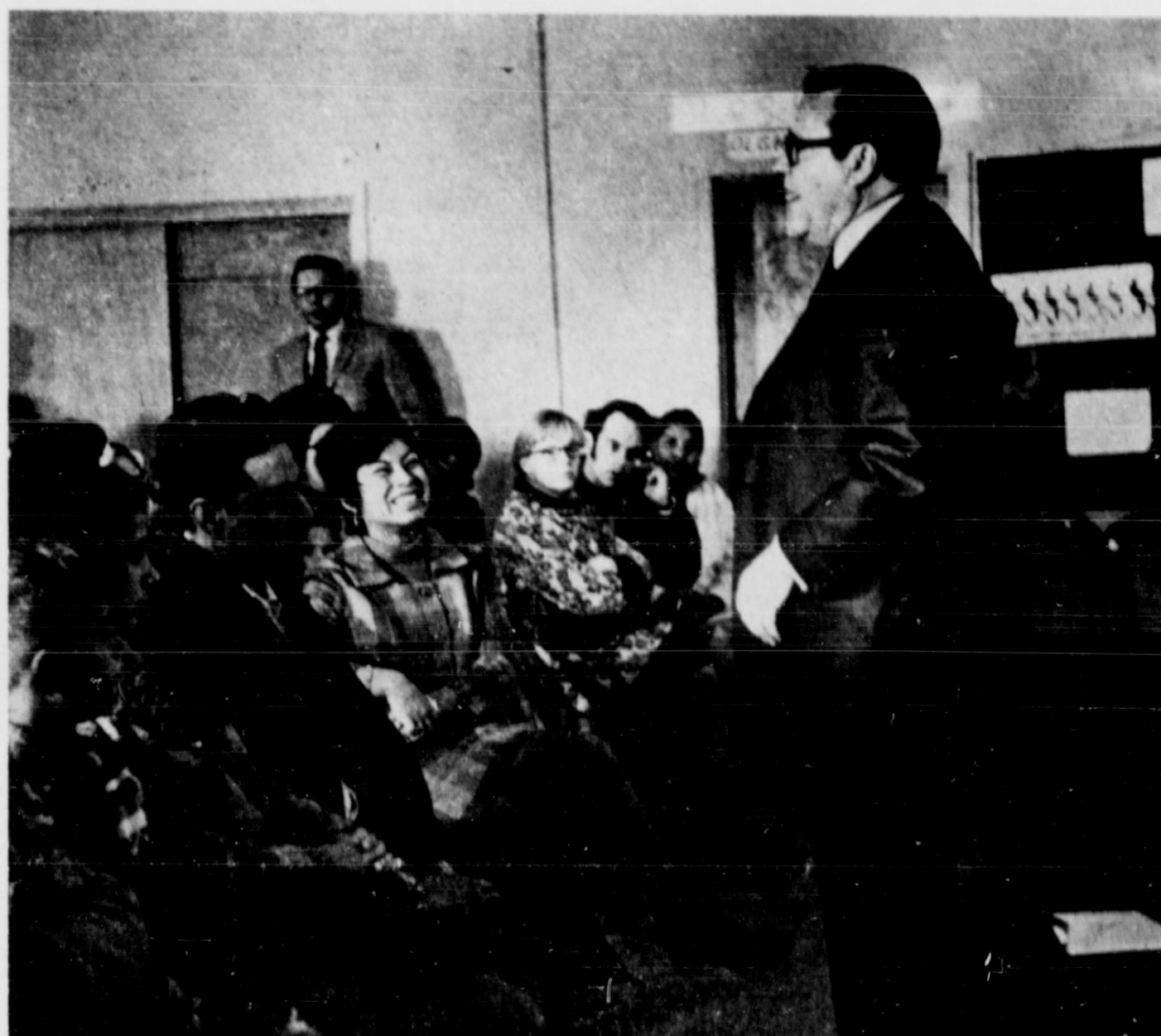
SENATOR RALPH W. YARBOROUGH speaking before a large group of chicanos (Mexican-Americans) at OUR LADY OF GRACE church, 3106 Erskine. More than 800 persons were there to greet the senator.

He fights the people's fights. And he wins.