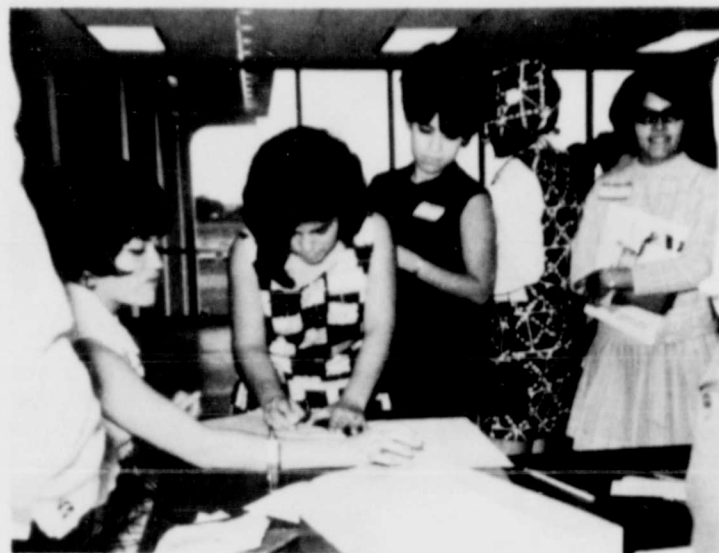
Chicano young and beautiful girls registering for the Tertuliano Seminar Workshop. La Voz urges all youths to attend this educational and fun event.