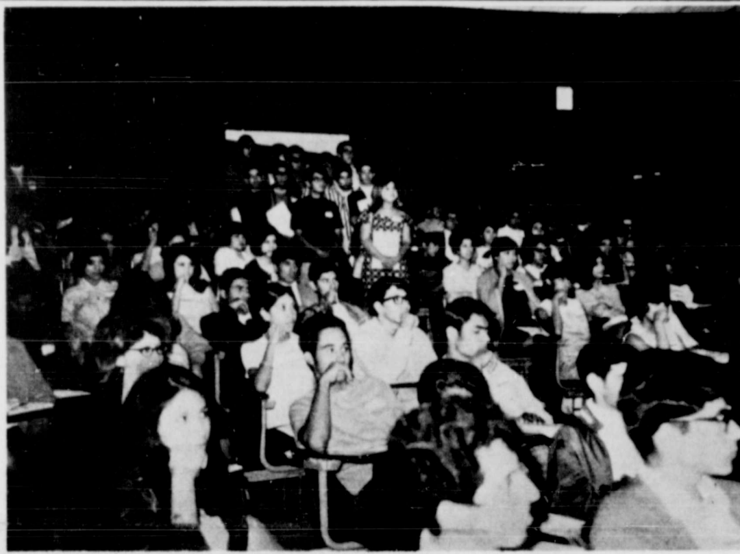
Attentive Youths. All Mexican-Americans. These are but a few of the hundred Jr. and Senior high school students who attended the Seminar Workshop sponsored by The Tertulianos — A Mexican-American Service Organization at Texas State University, (formerly Texas Tech).

Write the date on your wall so that you may not forget it — Sunday April 18, at 5 P.M. Viva La Causa!