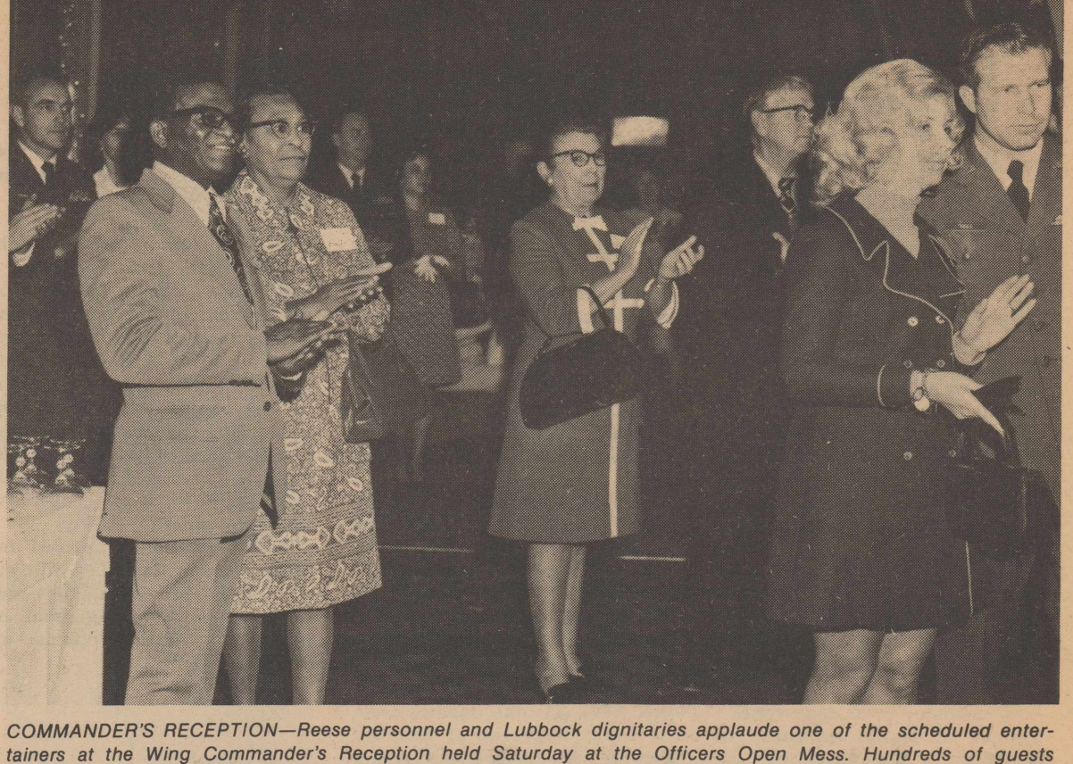
were on hand at the affair to celebrate a year in which many projects were undertaken by the combined forces of Lubbock and Reese.