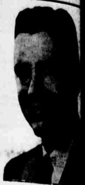
RALPH YARBOROUGH A DEMOCRAT FOR GOVERNOR