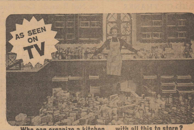
Who can organize a kitchen...with all this to store?