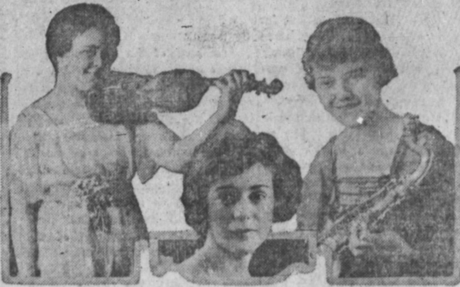
THE STERLING ENTERTAINERS