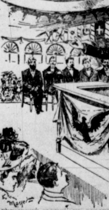
PRESIDENT CLEVELAND DELIVERING THE OPENING ADDRESS.