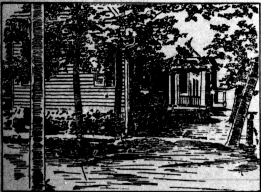
Mrs. Washington's Cottage at Fredericksburg, Where George Washington Bade Farewell to His Mother and Where She Died.

Across the river at the upper end of Fredericksburg is the great house of Kenmore. George Washington's sis-