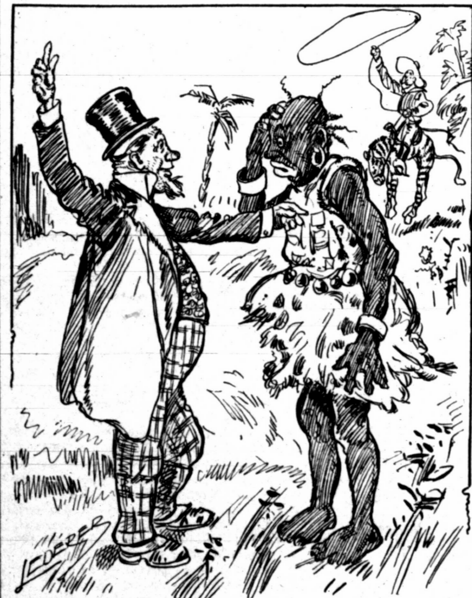
Pa Explained to the Old King That the Cowboy Was the Agent of the Great Spirit.

I got out about a dozen nigger chasers and some Roman candles, and told the cowboy I was going to have some fun scarring Pa's troops.