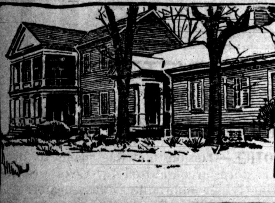
Chatham, on Part of the Old Washington Farm, Opposite Fredericksburg.

The mother of Washington was buried at a romantic spot in the Kenmore grounds. Soon after the death of Mrs. Washington her widowed daughter Betty moved from Kenmore to live with her daughter, Mrs. Carter, in Lancaster county. There she died in 1797 and her children sold Kenmore. The purchasers laid out their family burial ground close to the grave of Mary Washington, and inclosed their lot with a high brick wall, leaving the Washington grave outside. Mary Washington's grave was long neglected. Various efforts to erect a monument failed, until in the early '90s a Fredericksburg auctioneer offered the land on which the grave was for sale. This aroused indignation, money was subscribed and May 10, 1894, the present classic shaft that marks the grave of "Mary, Mother of Washington," was dedicated.