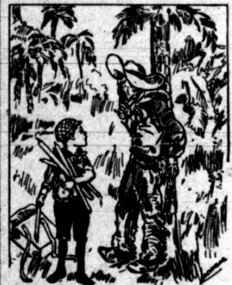
Told the Cowboy I Was Going to Have Some Fun Scarring Pa's Troops.

Pa and the cowboy have been training the male members of the tribe in the military drill, and we have got eight companies that can march by fours and in platoons.