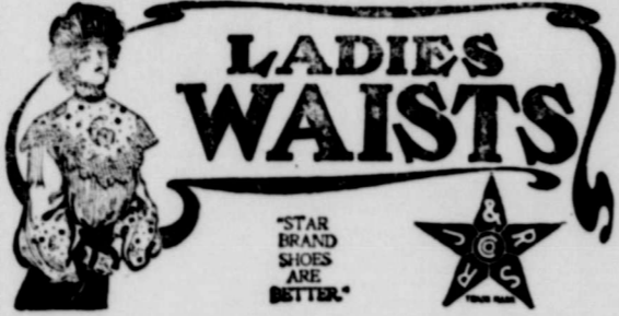
The prettiest and finest line of Shirtwaist Goods to be found in town.