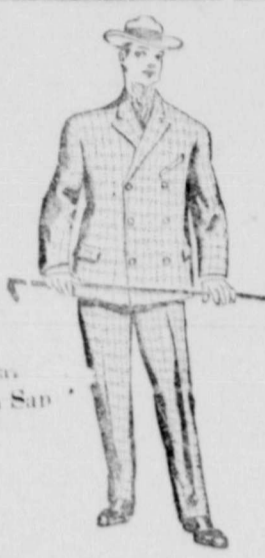
Young Man! We have a line of Clothing that will pay you to investigate

As evidence that our Millinery is RIGHT, we can't get enough of it. We have cleaned out and had to make a new order which will be here next week, and will have a special Millinery Day Saturday, the 13th. Don't forget the date, come, and see an entirely new and beautiful display.