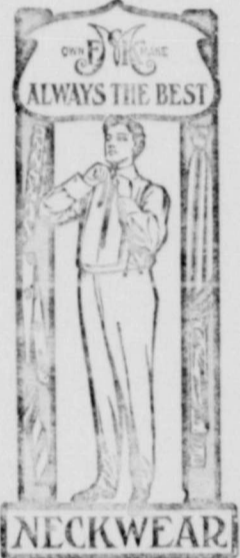
We have the prettiest lot Neckwear this season that we have shown for some time. See it