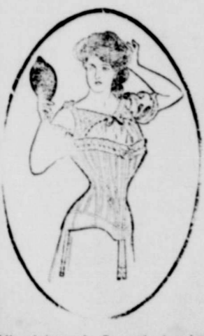
All styles of Corsets to be found here.