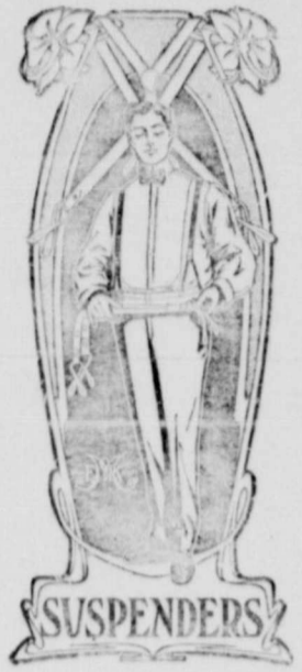
A comfortable Suspenders is the kind every man likes to wear. We sell 'em

Our spring and summer Dress Goods are selling fast. They are strictly up to date and just what the people want. They are going at prices as low as they can be sold for. We have dressmakers right in our house, and can make the goods up to suit you.