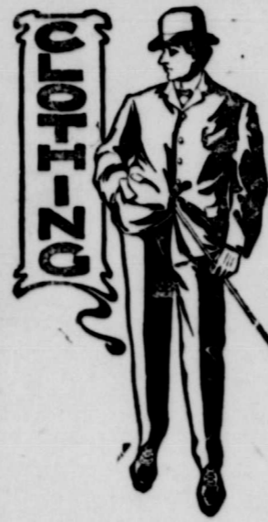
Latest styles in Clothing for Men.

See our new Shirtwaist Suits All tailored gowns. We take your measure and guarantee fit.