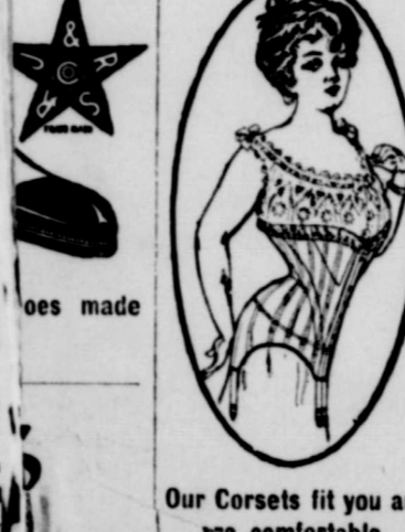
Our Corsets fit you and are comfortable.