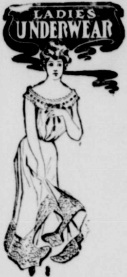
Beautiful line of Ladies Muslin Underwear.

is showing an unexcelled line of all the up to date styles of Dress Goods, Novelties and Clothing. Everything going at popular prices.