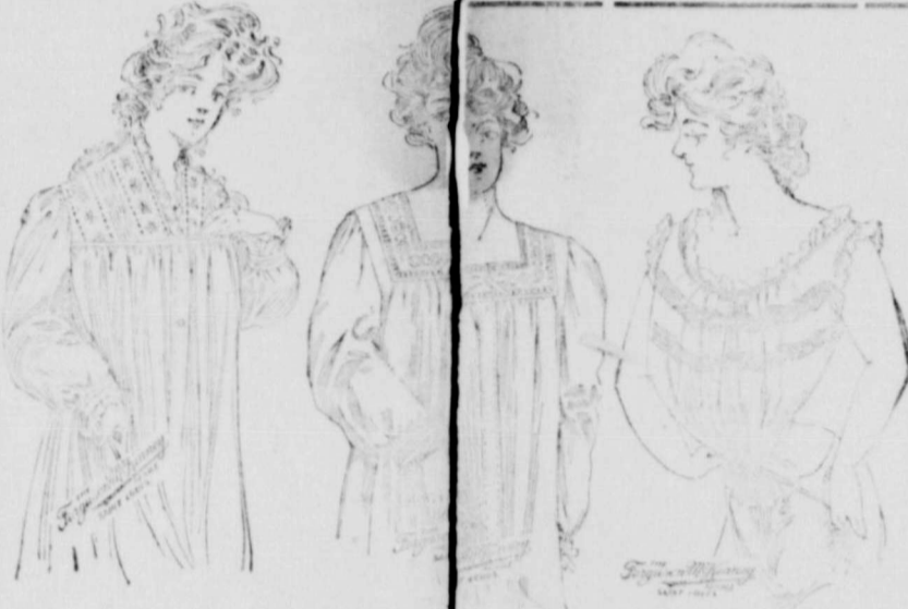
An unsurpassed line of Ladies Underwear.

We call your special attention to our large and complete stock of Rugs. Among these Rugs are many of the floral Hemp and Crex Grass Rugs in the newest styles and designs. Many other kinds that we are selling at tempting low prices. Special display, Saturday, 13th.