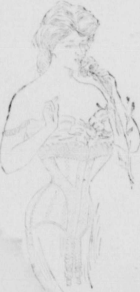
AMERICAN BEAUTY STYLES Kalamazoo Corset Co., Sole Makers The most comfortable, best fitting line of Corsets on the market

We call your special attention to our large and complete stock of Rugs. Among these Rugs are many of the floral Hemp and Crex Grass Rugs in the newest styles and designs. Many other kinds that we are selling at tempting low prices. Special display, Saturday, 13th.