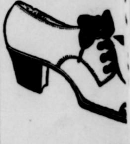
1907 styles the best on earth.