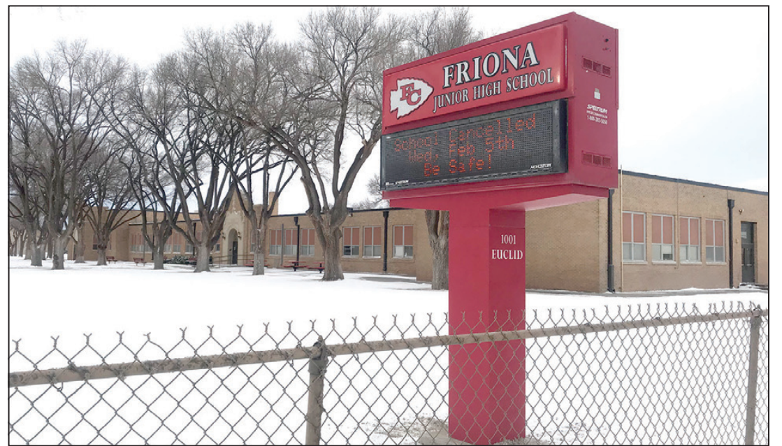
What was predicted as a "dusting" turned out to be a major 4.5 inch snowstorm that hit Friona on Tuesday. The low pressure veered northward and the temperatures headed south. School was cancelled on Wednesday as the Junior High School marquee indicates. The rain and snow received from December through this week has the area off to its best start to the growing season since 2017.

One additional factor looming over the planning process is that BNSF Railway is adding a third track in Parmer County. Train traffic will definitely be increasing in the future. New Mexico officials have apparently approached TXDOT district engineers concerning a possible overpass in Farwell/Texico.