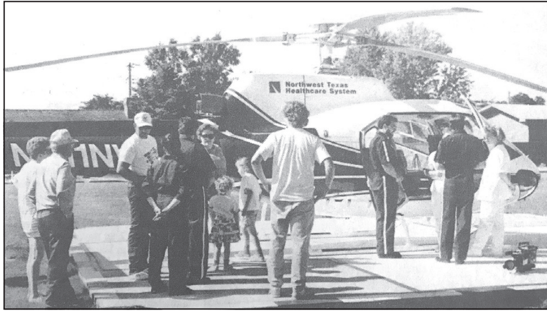
NEW COPTER VISITS... The new medical helicopter from Northwest Texas Healthcare System, Amarillo, paid a visit to Parmer County Community Hospital's new landing pad last Saturday morning. Hospital employees, EMS workers and other interested parties are shown looking at the red and white medical vehicle. (Friona Star, August 21, 1993)