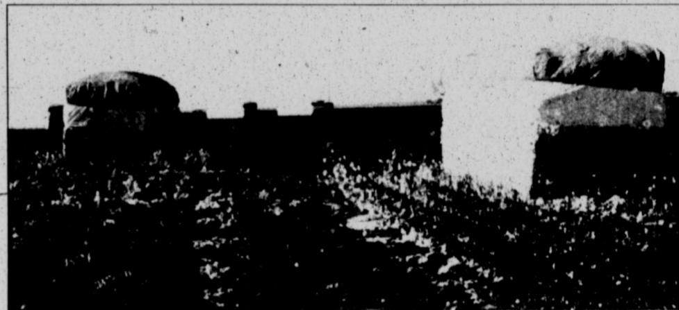
Common Sight ... Cotton modules in stripped fields are becoming a common sight once again in Lynn County, with area producers getting into full swing with the harvest during recent hot dry days. The cotton bale count at nine area gins was up to 70,235 bales as of Tuesday.

Meals will be delivered to shut-ins beginning at 4 p.m., and the school cafeteria will be open from 5-7 p.m. for community members to come eat.