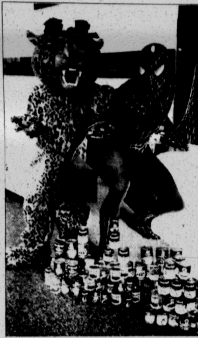
Lila and Spiderman ... Lila the Leopard joined Spiderman during Red Ribbon Week to get the students to bring canned goods for the South Plains Food Bank. When students brought 2 cans of food, they received a treat bag, in which some had certificates for larger prizes. Lila is the New Home Mascot, and has been in the Mascot Mania competition on KCBT.