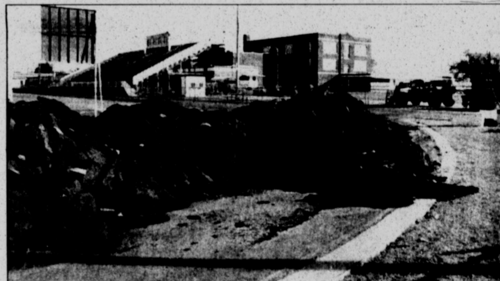
Hard to run on this track ... The Tahoka High School track is temporarily closed while it is being resurfaced. Workers this week began removing the top surface of the track, and the project is expected to be completed in two weeks.