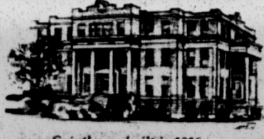
Courthouse built in 1916