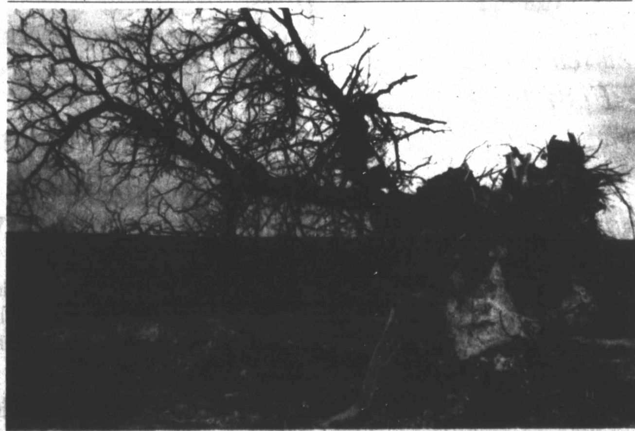
AND THEN THERE WERE NONE - The view for travelers along U.S. Highway 87 in Lynn County has changed dramatically during the past week, with 40-year-old trees uprooted and left for removal along both sides of several miles of the highway between Tahoka and the Lubbock County line. The trees were uprooted by the Texas Highway Dept. as part of reconstructive upgrading of that section of highway, to meet federal safety standards recommending a 30-foot clear zone. (See related story.)

He did say that the stretch of U.S. 87 between the FM 400 overpass north of Tahoka and the overpass near the cemetery on the south side of Tahoka is in the planning for reconstruction in the next 2-3 years, and that the possibility of accessing city water lines for planting trees along that area may be considered.