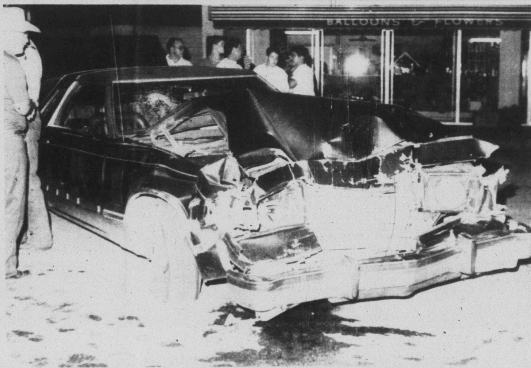
HEAVY DAMAGE —This 1979 Ford Thunderbird suffered extensive damage in a collision on Main St. in Tahoka Saturday night. Four vehicles were involved; one person, a passenger in this car, was injured.

In jail during the week were two persons for public intoxication, and one each for the following: disorderly conduct, false report to a police officer, DWI first offense, no drivers license, failure to control speed, failure to maintain financial responsibility, DWI judgement and sentence.