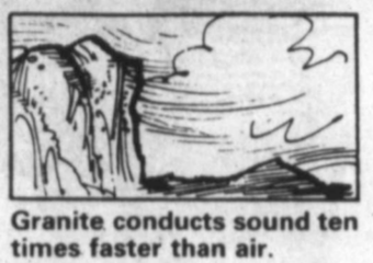
Granite conducts sound ten times faster than air.

Mt. Everest is a foot higher today than it was a century ago, and it may be growing at an accelerating rate.