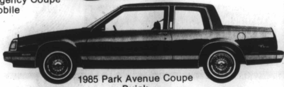
1985 Park Avenue Coupe Buick