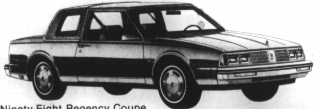
Ninety-Eight Regency Coupe Oldsmobile