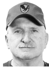
HERE'S TO YOUR HEALTH

Dr. Ancel Keys, MSc, PhD (1904 - 2004) launched his infamous "Seven Countries Study" (SCS) in the late 1950s, researching cholesterol and dietary fat's relationship with coronary heart disease in Greece, Italy, Spain, South Africa, Japan, and Finland. It should be noted that there were actually 22 countries involved in his study but he "cherry picked" only the countries whose data sup-