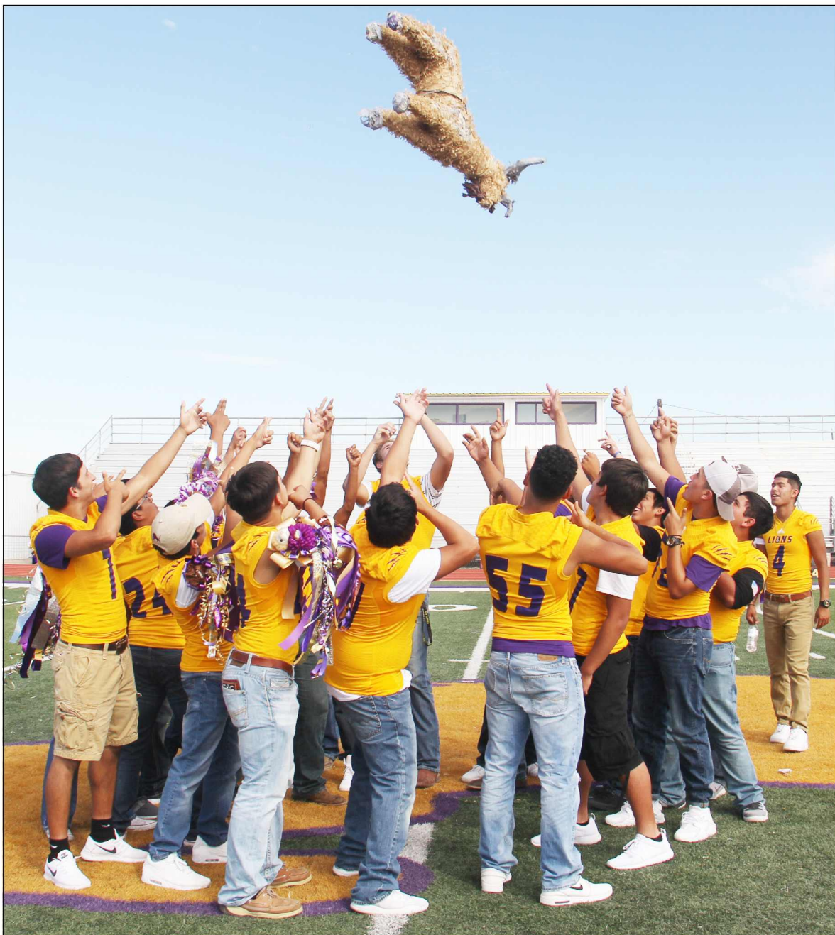
THE WINNERS FROM THE 2016 OZONA HIGH SCHOOL HOMECOMING SPIRIT DAYS WERE RECOGNIZED DURING THE HOMECOMING PEP RALLY HELD AT LION STADIUM AFTER THE PARADE ON FRIDAY, SEPT. 30.