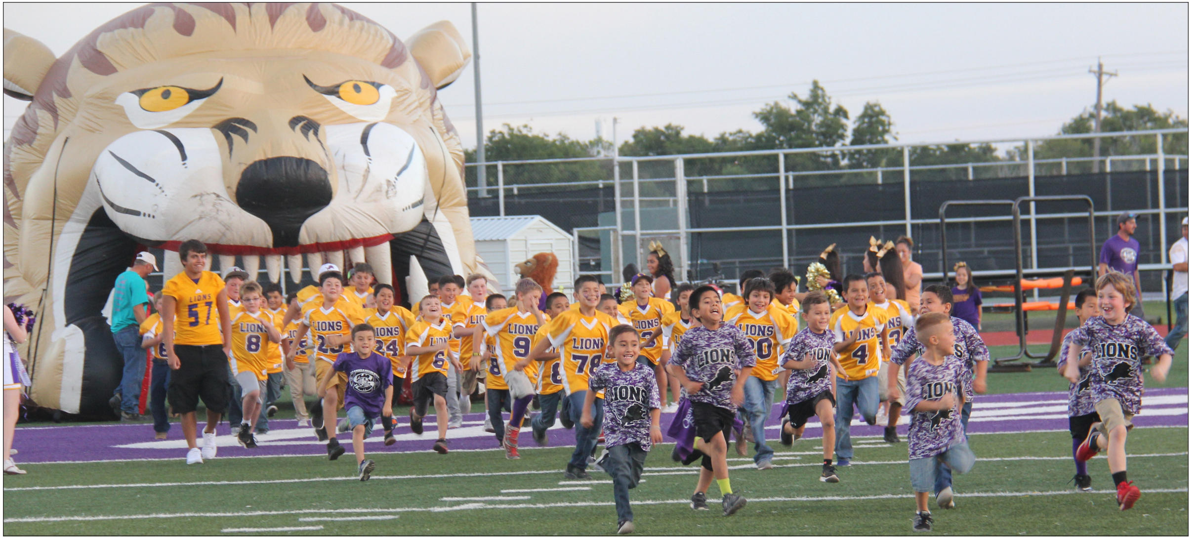
MEMBERS OF THE OZONA YOUTH FOOTBALL AND FLAG FOOTBALL TEAMS PARTICIPATE IN FUTURE LION NIGHT AS THEY EXCITEDLY RUN THROUGH THE LION BEFORE THE OHS HOMECOMING GAME ON FRIDAY, SEPT. 30.