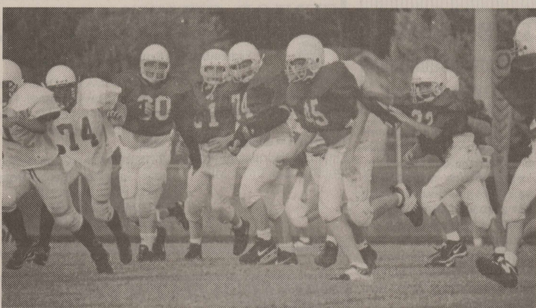
JUNIOR HIGH BUFFS ON THE MOVE