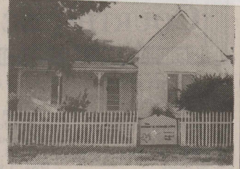
ROBERT E. HOWARD MUSEUM Price 50¢