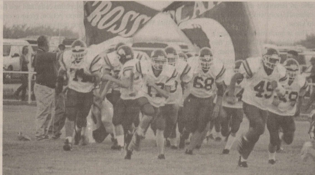
BUFFALOES STAMPEDE THE FIELD