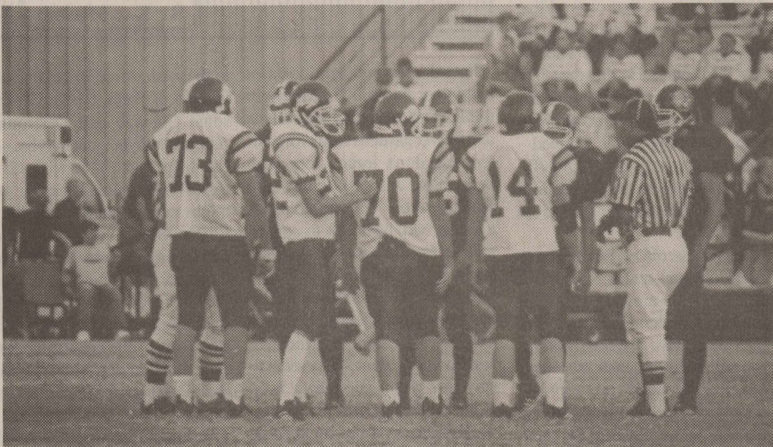
VARSITY BUFFALO CAPTAINS AWAIT THE COIN TOSS