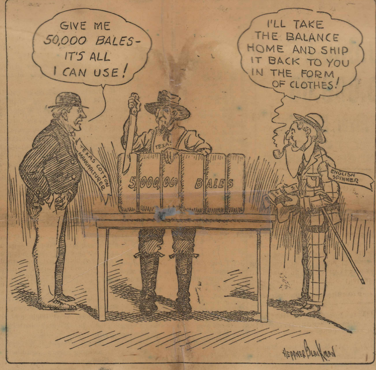
First in production, first in cosumption and last in manufacture.