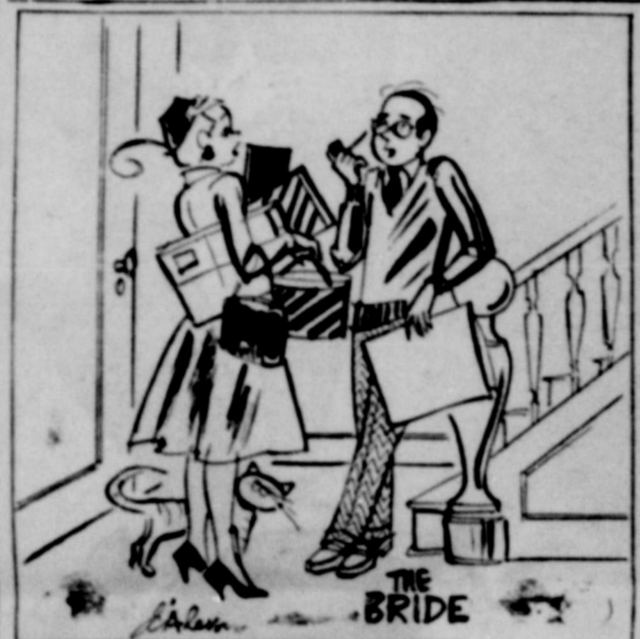
"So where's that pipe tobacco I just asked you to run out for?"