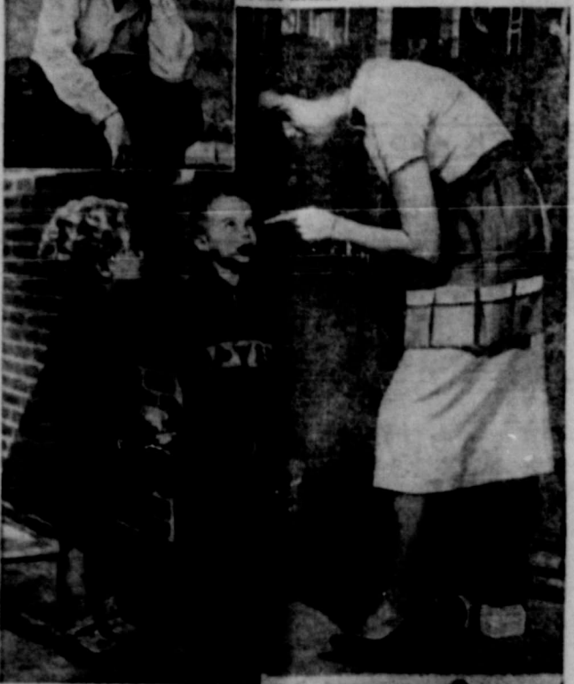
WHETHER THEY ARE happy about school or not, if you drive you have a responsibility to see children arrive there safely. Watch for signs like this one. Slow down as you approach, ready to stop.

SUMMER'S END and the start of another school year is a time of mixed emotions for youngsters. Caught in these photos are two quite different yet typical reactions. An "old hand" at cracking the books (left) frowns dejectedly. To him, school is only a confinement. To the tots receiving last minute instructions from mother (below), however, school is an awesome adventure—their first "away from home."