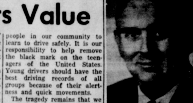
JUDGE JOE GREENHILL

ould want to learn how to ive safely. We should be a ader in the interest of safety r others and make every ef-