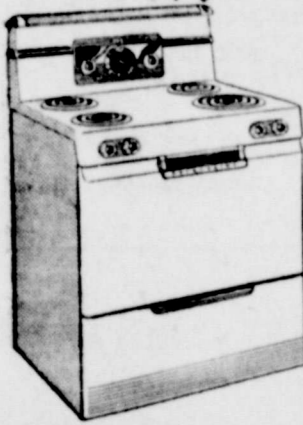
Recommended by Arthur Godfrey on his daytime Radio and TV Show