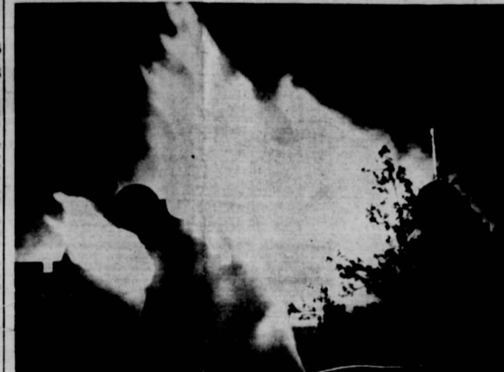
Pictured above enveloped in flame, as hundreds of Spur residents, both old-timers and new-comers, viewed the famous landmark on Tuesday evening, is the Spur Inn. The Inn, known throughout West Texas for its comfort and hospitality since its construction following its construction in 1910.

Destruction of Historical Landmark Brings Back Many Fond Memories