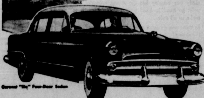
Coronet "Six" Four-Door Sedan

A new high in luxury at a new low price!