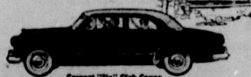
Coronet "Six" Club Coupe

Now if you want smooth, economical performance plus the added style and prestige long associated with the Dodge Coronet name, here it is! It's yours at a new low price—only slightly above the lowest-priced cars! See it—drive it at your nearby Dodge dealer's today!