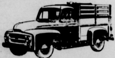
New Model B-120 pickup with Ad-A-Rok attachment.

Many improvements and new features have been proved and added to the thrifty "Silver Diamond" engine which powers the light and medium-duty models in the New International Truck line. With this powerful engine, the New International light and medium-duty models develop more power and lower-cost performance.