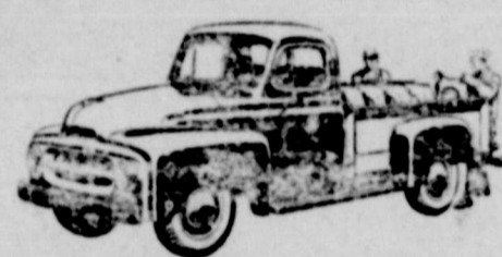
New Model B-110 pickup with 8-foot body. Other pickup models available with 6' and 9-foot bodies.

New features you want in America's most complete truck line: 168 basic models... New International styling identified by the Hi emblem... 307 new laboratory-proved, road-proved features... First truck builder to offer choice of gasoline or LP gas with Underwriters Laboratories listing in 1 1/2-ton sizes and other models... Comfo-Vision cab with one-piece Sweepright windshield... Steel-Flax frames... 256 wheelbases... Easy steering, greater fuel economy... Wide range of axle ratios... Real steering comfort and control... Sizes from 1/2-ton to 90,000 lbs. GVW rating.