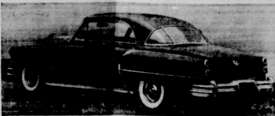
Shown in the newly introduced 1953 Custom Imperial Newport which is being shipped to Chrysler's 3,500 dealers throughout the United States. Featuring Chrysler's new and beautiful body styling with long, low lines, this sleek automobile is powered by the Chrysler V-8 150-horsepower FirePower engine and has a wheel base of 131 1/2 inches. It is available with full-time power steering and power brakes and is offered in fifteen solid colors and six-tone color combinations. Beautifully styled interiors offer a choice of three leather and broadcloth combinations to harmonize with the exterior colors.