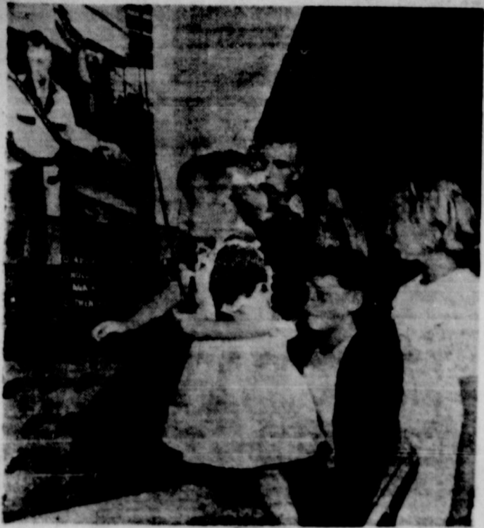
A SUPER-SENSITIVE instrument used by Fisher Body engineers is one of more than 100 engineering, research and science exhibits in the General Motors Motormans of 1933 which will be seen at the Automobile Building of the Dallas State Fair Grounds, May 16-24. Here a young show visitor sees the instrument to watch a tracing of her heart beat.

Another highlight feature of the admission-free Motormans is a huge choral-ballet presentation, dramatizing the role of engineering and science in modern civilization. Also on stage will be a fashion display, featuring gowns created by leading designers. Record crowds have visited the Motormans at New York, Miami, Los Angeles and San Francisco.