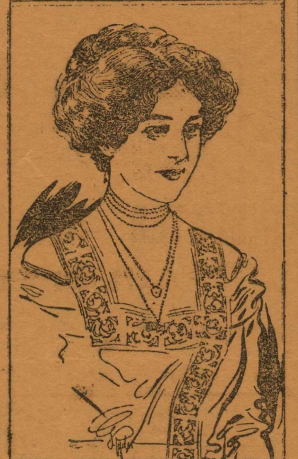
She was prettier than her photograph.

gently fancied Hillard from the start, and he on his side found her well educated, witty and unaffected. She was even prettier than her photograph. Merrilow's face beamed upon them both in a kind of benediction. He had known all along that once Jack saw Kitty he would become a good ally in fighting down her objections. "Think of singing in Italy!" cried Kitty. "Isn't it just wonderful?" "And has Merrilow told you to get a return ticket before you sail?" with half a jest. "Don't you think it will be successful?" a shade of disappointment. "There will be thousands of lonesome Americans over there. Out of patriotism, if for nothing else, they ought to come to see us." "They certainly ought to. But I'm an old kill-joy." "No, no; go on and tell me all your doubts. You have been over there so many times." "Well, supposing your tourists are tired after having walked all day through the churches and galleries, they may want to go to bed early. But you never can tell till you try. You may become the rage on the continent. Yet you go into the enemy's country. It isn't the same as going to London, among tolerant cousins. In